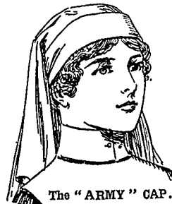
The "ARMY" CAP.

Fine Lawn Hemstitched 27 inches square .. 1/9 31 inches square .. 2/3 36 inches square .. 2/6 Also in ORGANDI 6d' extra each size. V.A.D., 27 x 19 .. 1/4