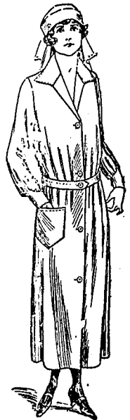
The "WIMPOLE" Coat Overall, made of White Drill, as sketch, or elbow sleeves. Women's 1st Quality 11/9, O.S. 12/11. Women's 2nd Quality Drill 8/11, O.S. 9/11.

Women's 6/11 each. O.S. ditto. 7/11 each.