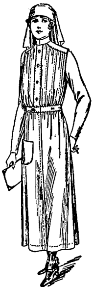
The "BUCKLAND" UNIFORM DRESS. Plain and Striped Zephyr .. 3/11 Made to measure 1/- extra.

Coat and Skirt same prices. Official permit required.