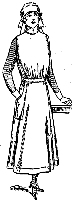
The "HARLEY" APRON Linen-finished Cloth Skirt. Length, 32 to 38 inches. 2/11, 3/11, 4/11 & 5/11. Can be made to measure in 4/11 and 5/11 qualities