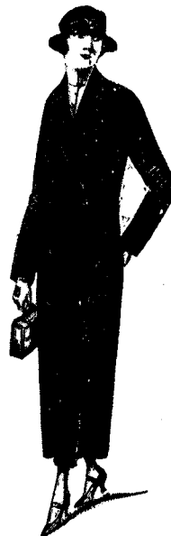
The State Registered Coat and Uniform can be seen in our Showroom.

Fine Lawn Hemstitched 27 inches square .. 1/9 31 inches square .. 2/3 36 inches square .. 2/6 Also in ORGANDI 6d' extra each size. V.A.D., 27 x 19 .. 1/4